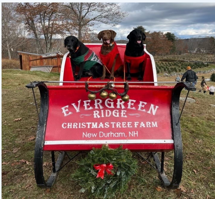
These are my dogs, aka my best friends (L-R) is Tuukka 10 (English Black Lab), Diesel 2 (Chesapeake Bay Retriever), and Jake 5 (1/2 English Black Lab & 1/2 Chesapeake Bay Retriever)